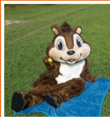
Having a Picnic at Taylor Park