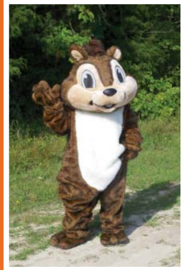
Walking the Trails at Poor Farm Park